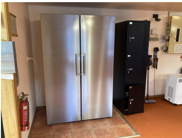
West Wing Freezer

Each fridge has been set up with a single shelf per room (with extra shelf space for family rooms), a designated container for communal food store items that need refrigeration, and a taller shared space at the bottom.