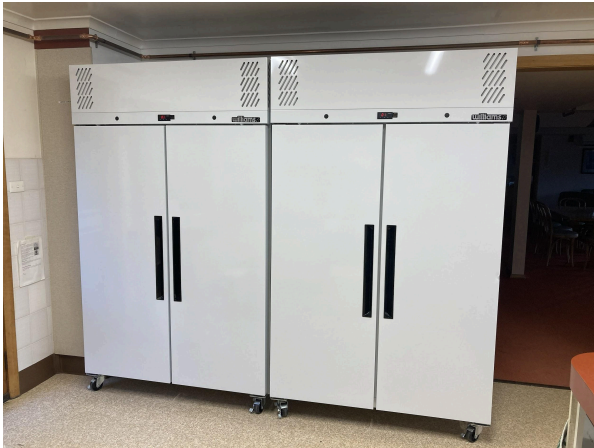
West Wing Kitchen Fridges

After a run of failures across our older units - broken door shelves, leaking seals, and two additional fridge breakdowns - the board approved an upgrade. In April, we installed Williams commercial double-door fridges and Miele freezers. The new units increase storage capacity and should provide considerably better reliability going forward.